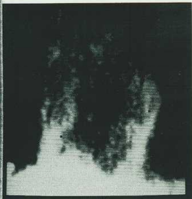
Fig. 2 The same region as in Fig. 1 but on a grey scale. The background smooth structure with scale sizes > 1^\circ has been subtracted from the original, so that the ridge structures are clearer. The map has been convolved to a 3 arc min beam.